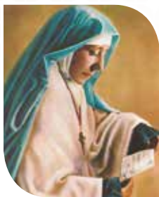
Our namesake The Venerable Mary Potter

For further information, or to make a donation, please see our website: