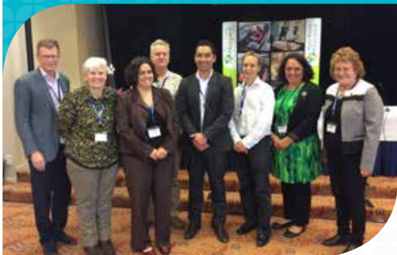
Speaker panel at The Dying Mind Symposium 2016

Mary Potter Hospice provides a wide range of learning opportunities for health professionals, health workers, community workers, and groups.