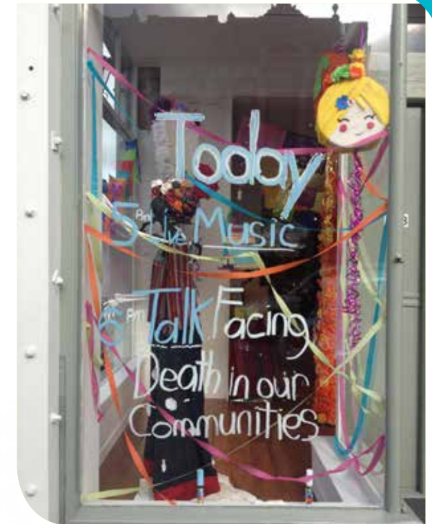
Dia De Los Muertos – the Mexican Day of the Dead Public Talk 2016

Our education team can also co-design workshops to suit your unique community's needs so don't hesitate to contact us with your questions.