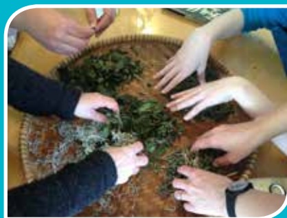
Rongoa Workshop during Matariki – traditional Māori healing plants