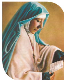
Our namesake The Venerable Mary Potter

Aroha Mana Kaitiakitanga Manaakitanga Rangatiratanga