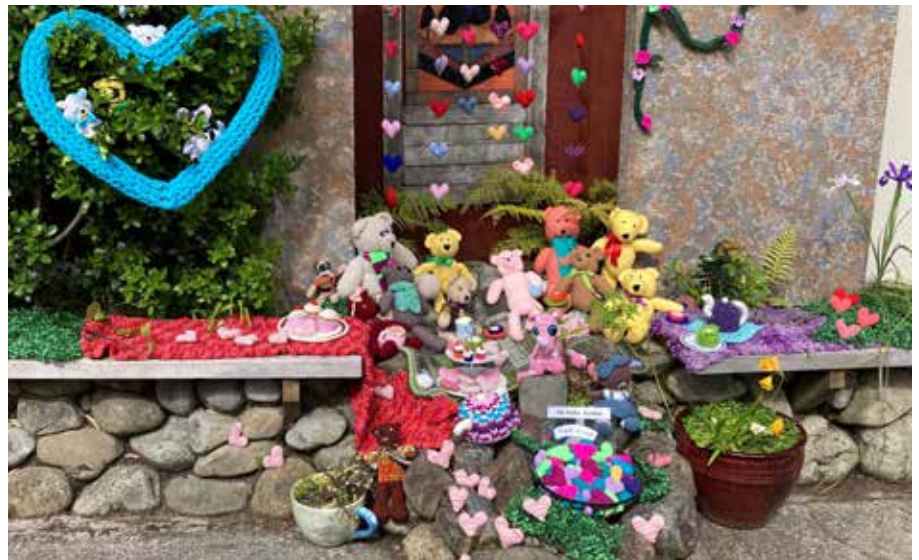
The beautiful knitting by staff at Mary Potter Hospice.