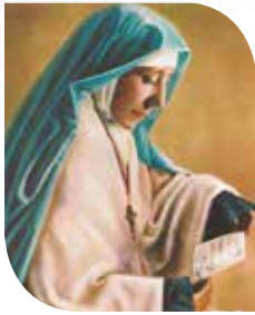
Our namesake The Venerable Mary Potter

For further information, or to make a donation, please see our website: